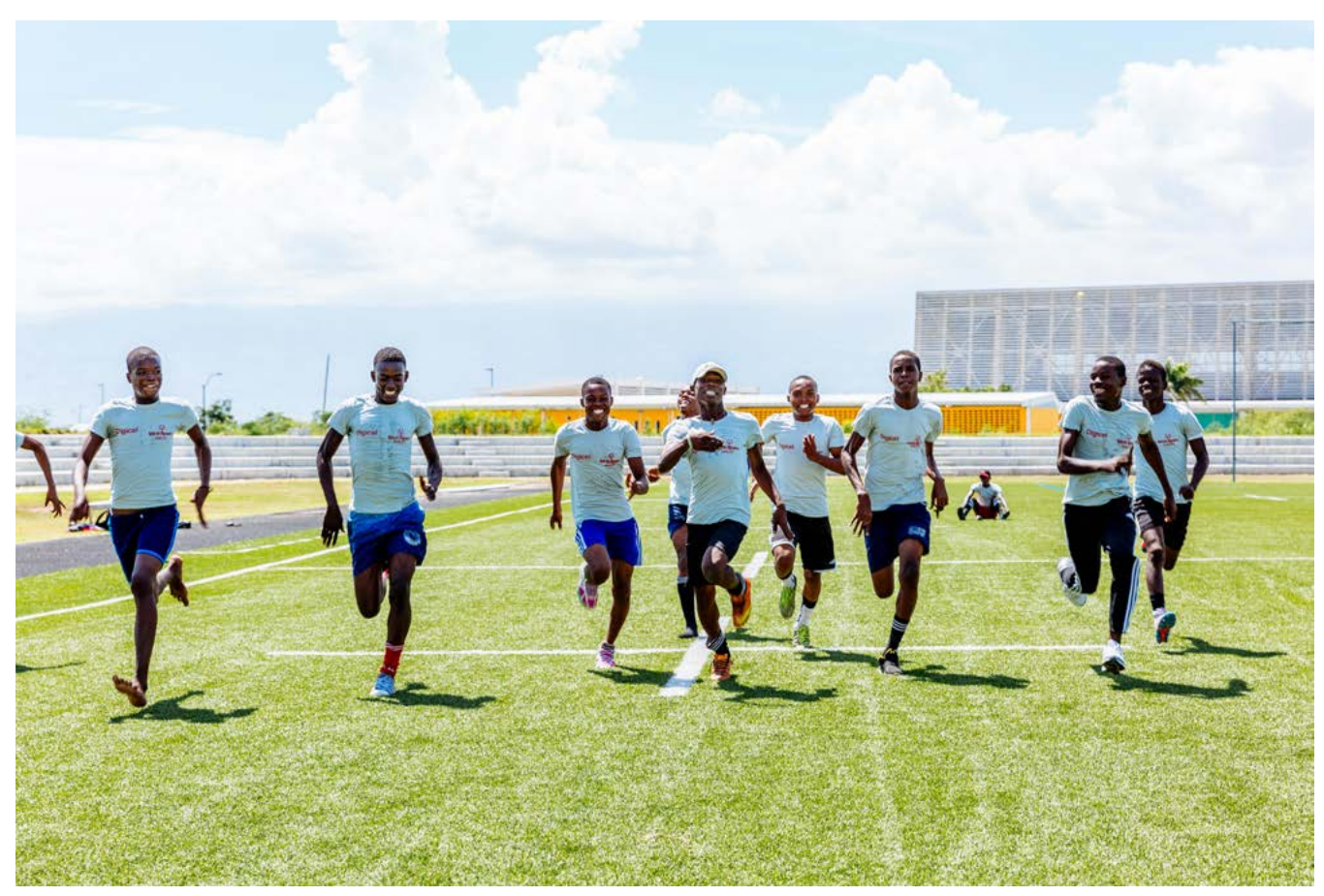
Special Olympics Haiti