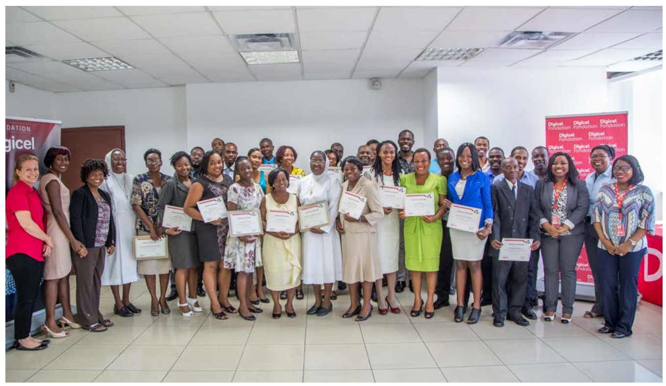
The 20 best teachers receiving certificates