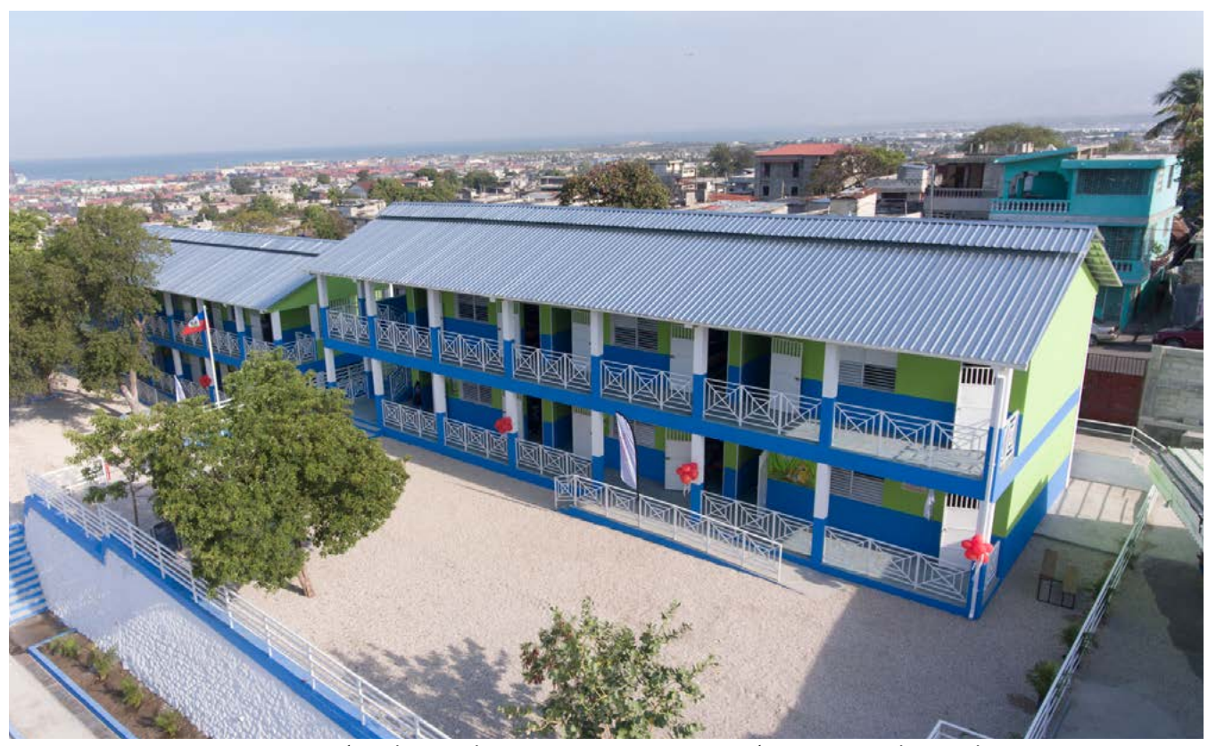
Ecole Congréganiste Nationale Notre Dame du Perpétuel Secours in Bel Air