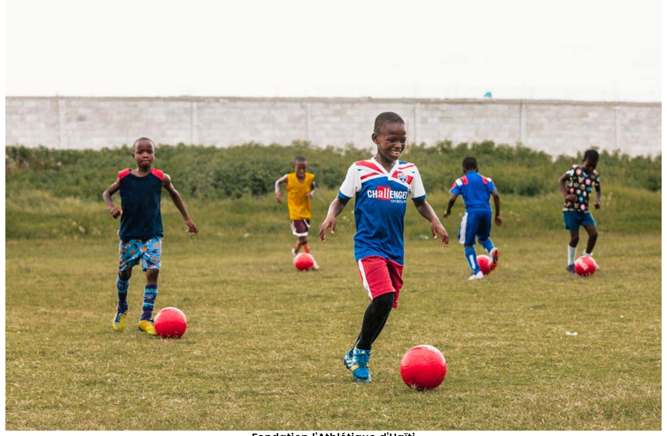
Fondation l'Athlétique d'Haïti