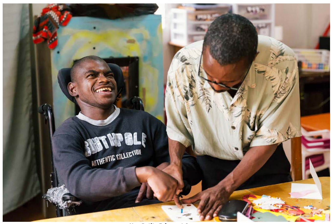
Nos Petits Frères et Soeurs