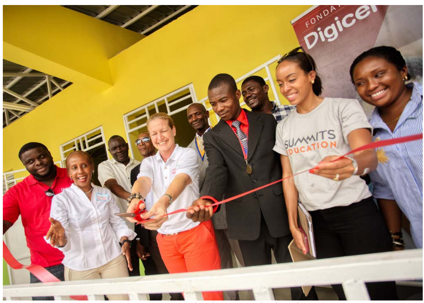
Ecole Communautaire Mixte Cholette in Mirbalais