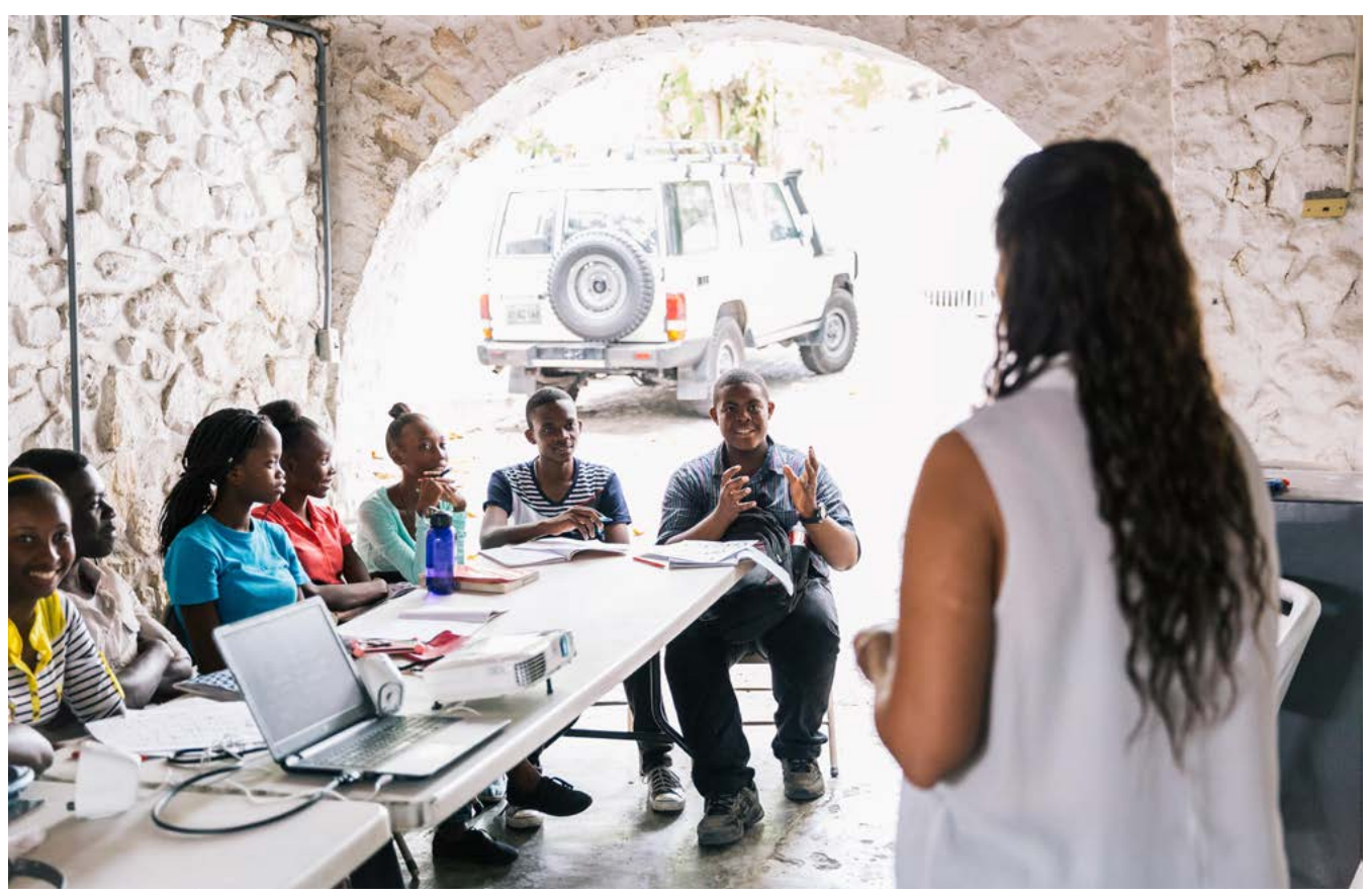
Haitian Education and Leadership Program