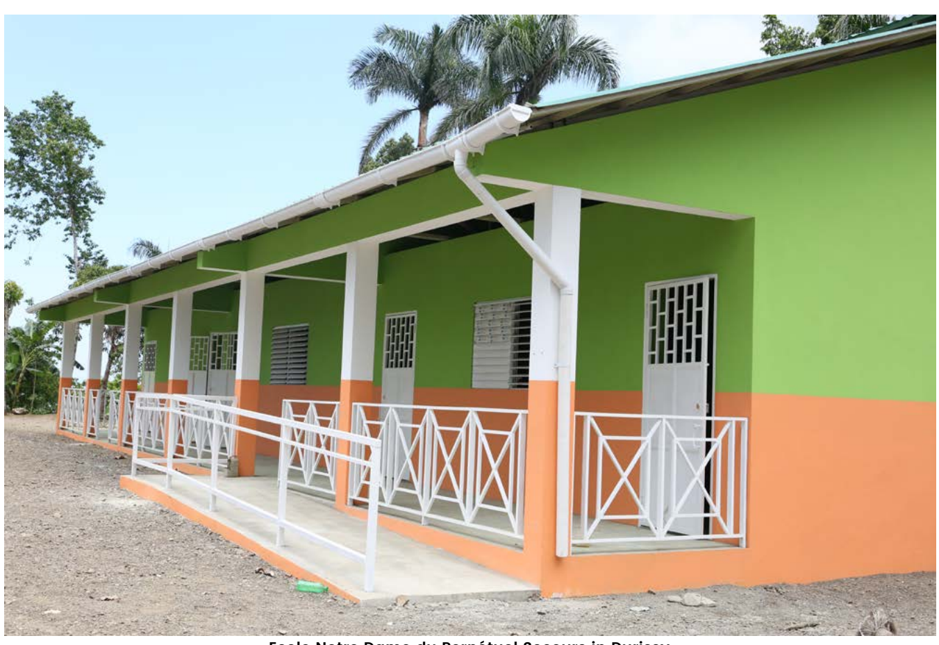
Ecole Notre Dame du Perpétuel Secours in Durissy