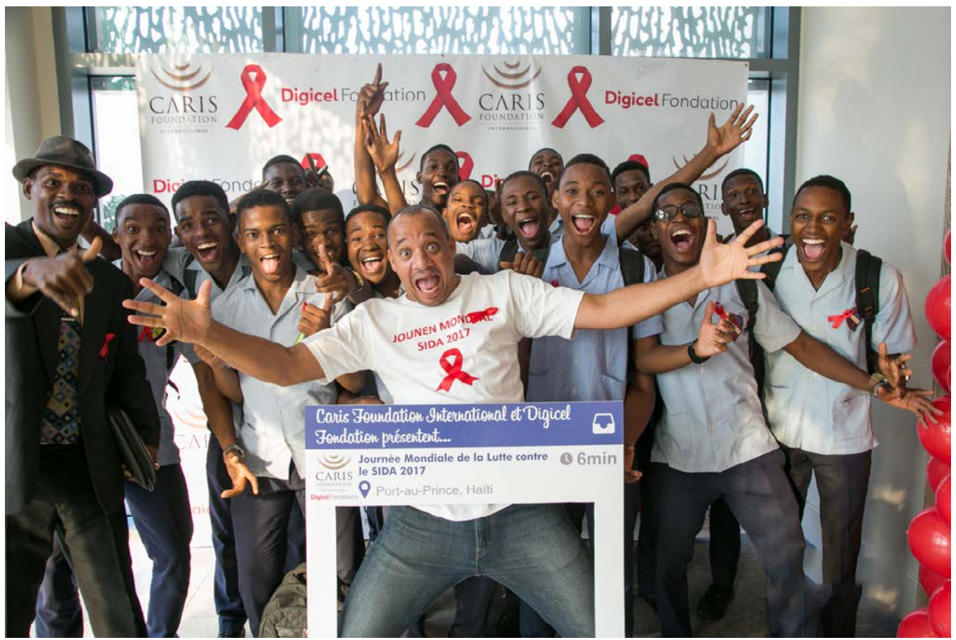
Engagement activity organized for World AIDS Day