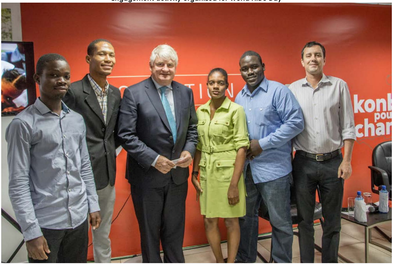
Activity organized for HELP students