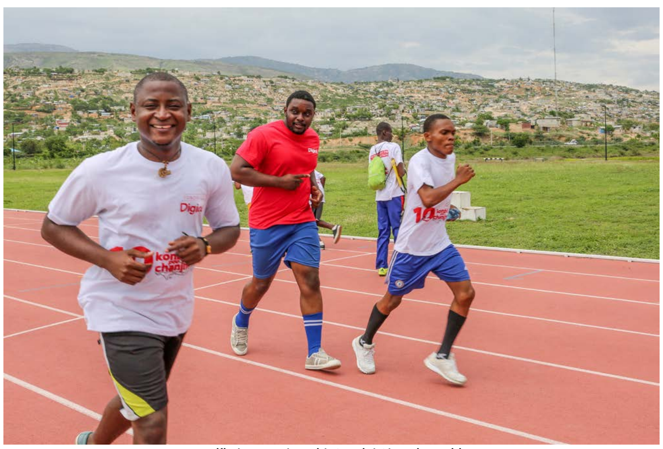
Unified sports day with Special Olympics Haiti