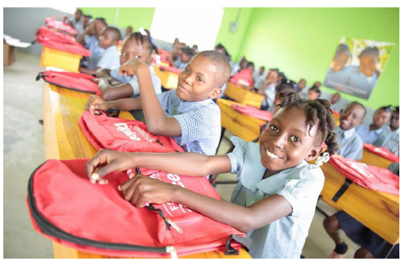
Ecole Nationale PJ Mara de Jolivert in Bassin Bleu