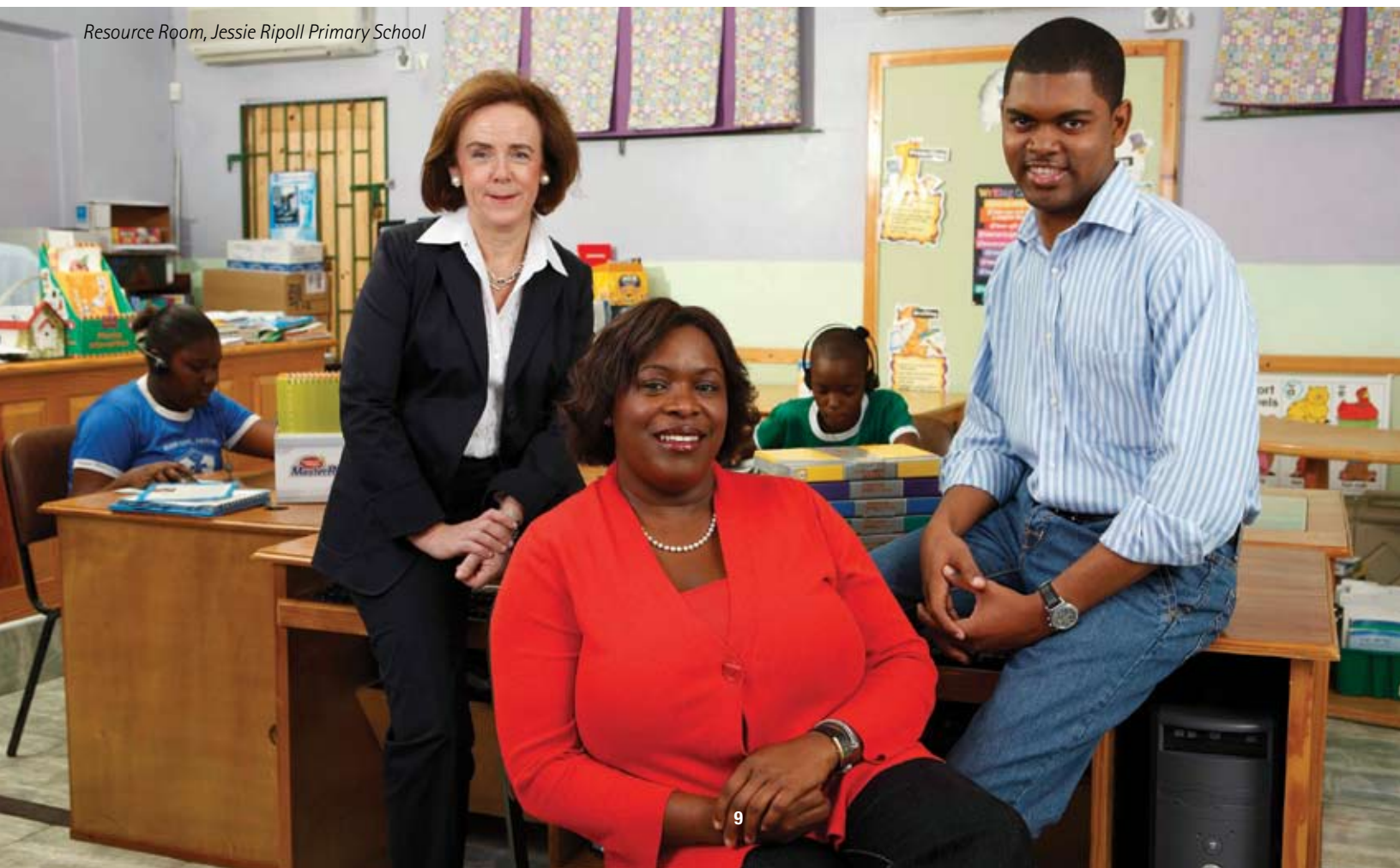
Resource Room, Jessie Ripoll Primary School